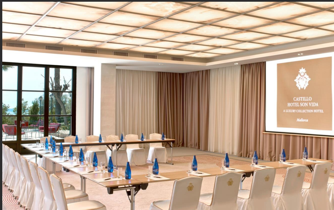
Mallorca (part of Baleares)