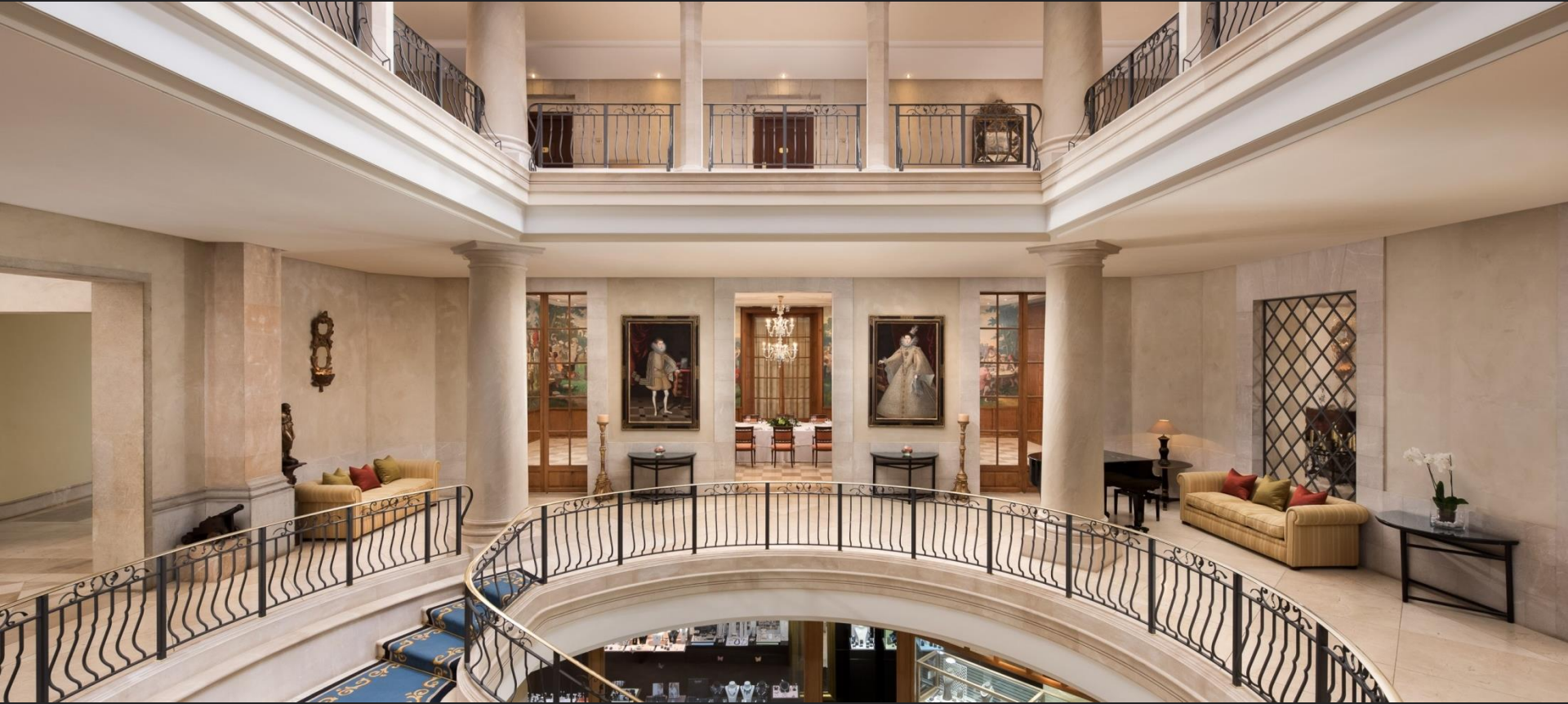
CASTILLO HOTEL SON VIDA, A LUXURY COLLECTION HOTEL, PALMA DE MALLORCA, SPAIN