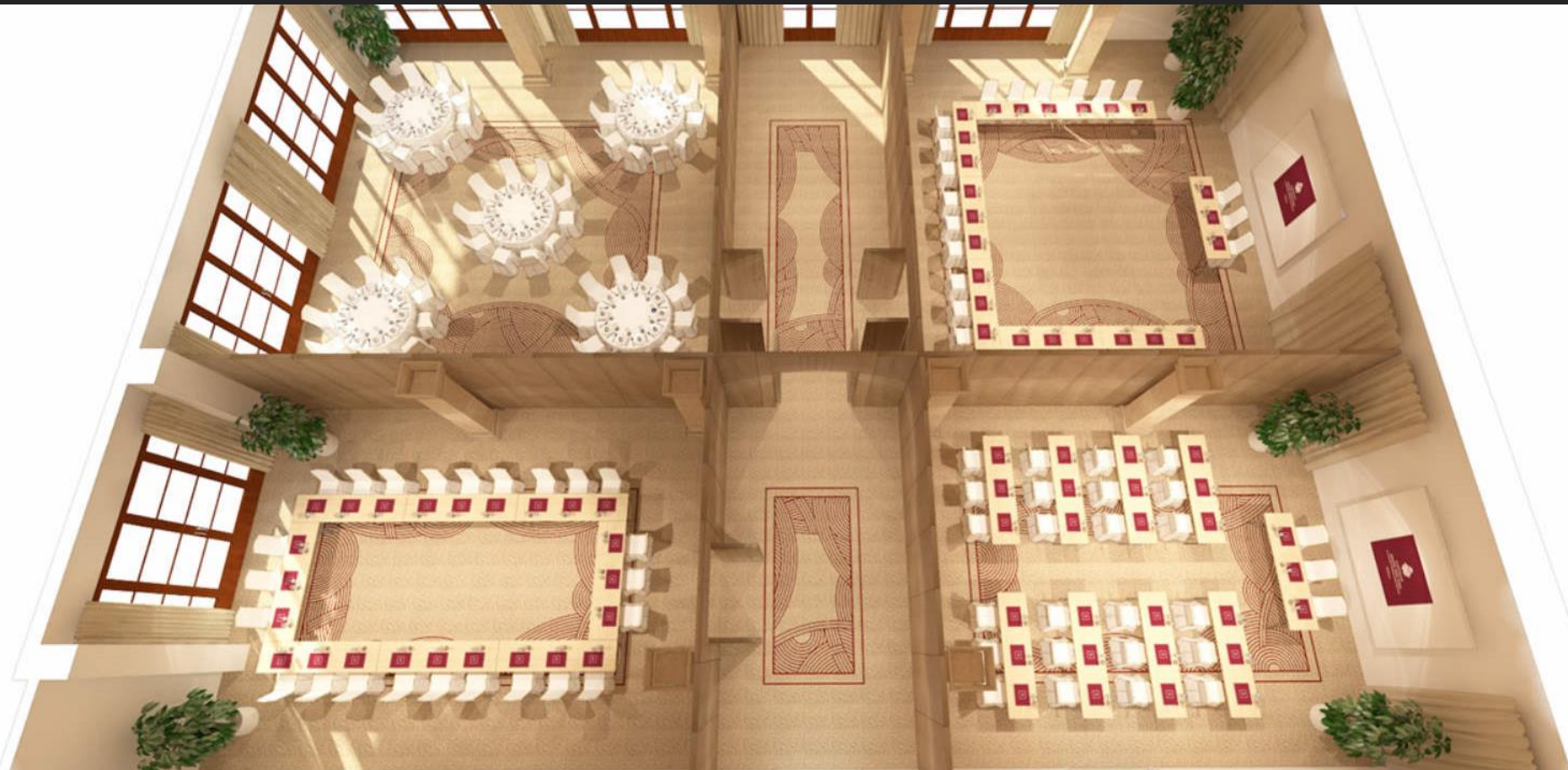
BALEARES, CASTILLO HOTEL SON VIDA, A LUXURY COLLECTION HOTEL, PALMA DE MALLORCA, SPAIN